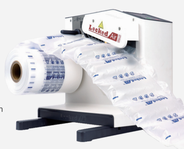
Size (mm): 360*300*345